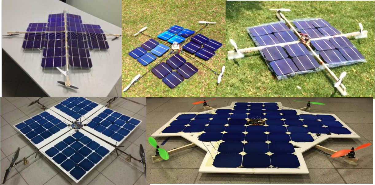
Figure 2: Iterations of the solar aerial vehicle (clockwise from top left) by completion date: 2012 (12 cells), 2013 (16 cells), 2014 (16 cells), 2015 (48 cells), 2016 (64 cells).

The project involves multidisciplinary design skills, touching on computing/control, mechanical engineering (frame design, motor selection), wireless technology, solar cell integration and maximum power point tracking, power systems design, and engineering project management and teamwork. Although a challenging project, students are highly motivated. Attempting a world-record goal stated in clear and simple terms, working in a motivated and interdisciplinary team of fellow students, working with a project that can be easily understood to non-technical people, and having tools available to make meaningful progress are all hallmarks of a sought-after “popular” final year project. Starting in 2016-2017, we have moved this project to the “Design Centric Curriculum”, where students from various engineering disciplines can work together on an engineering project.