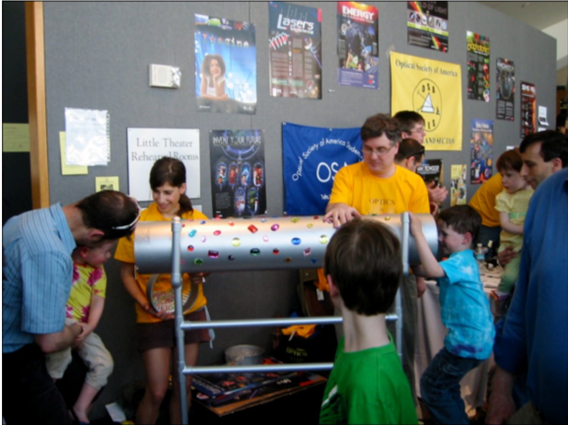
Figure 1 Kaleidoscope used at both ends.

We allow the kaleidoscope to violate the Concept/Context rule since it is just plain fun for parents and kids. We also will remove the eyepiece and target (Figure 1) to allow folks to look at each other from both ends. Removing the target and replacing it with a parent's face frequently results in gasps and is entertaining to both ends. We also encourage parents to take photos of their multi-faced (Figure 2) children so the participants have something to remember the experience.