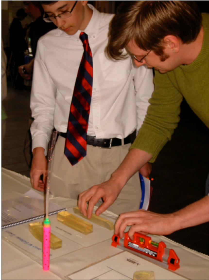
Figure 4 Co-author demonstrating Total Internal Reflection in Gelatin Lightpipe

As mentioned before, we now place gelatin between the polarizers. Placing a rubber band around a block of gelatin provides the stress needed to show the birefringence. The gelatin and also be pushed and squeezed showing the birefringence affects.