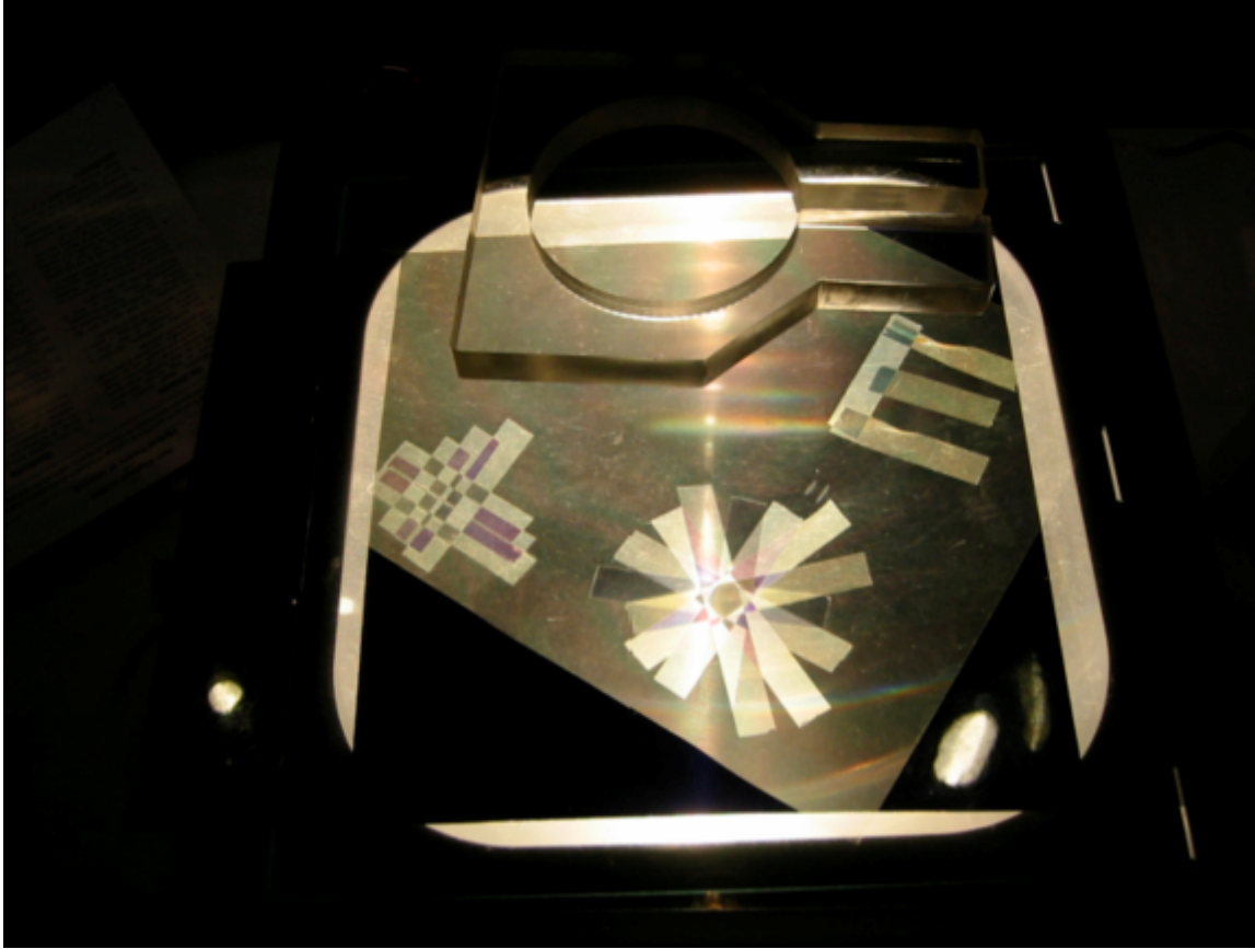
Figure 5 Birefringence of tape shown between two crossed polarizers on a light table

Optical power is based on a refractive index difference, higher power with a larger difference. The water tank readily shows this concept by measuring the focal length of the beams as they converge from the positive lens in water and then in air. The four times index difference increase causes a similar four times increase in optical power when the focal point goes from 12 inches to 3. This can lead to discussions on underwater goggles and thickness of one's eyeglasses.