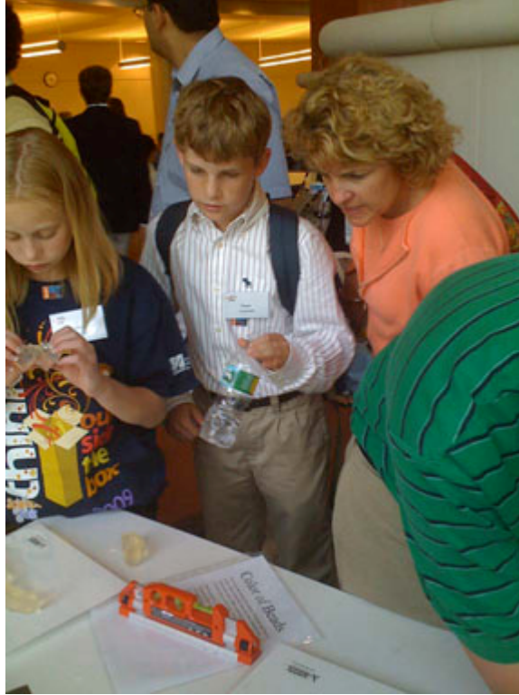
Figure 6 Student explaining refraction to parent