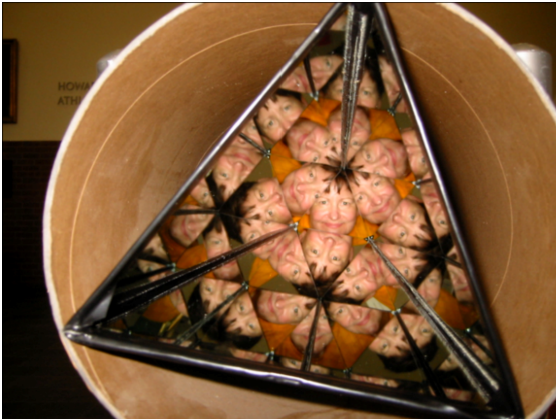
Figure 2 Kadeiscope image of one of the co-authors