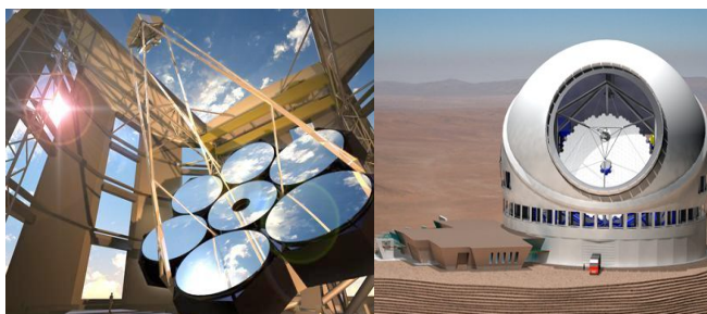
Two potential designs for the GSMT: The Giant Magellan Telescope (left) and the Thirty Meter Telescope (right).

Hands-On Optics (HOO)[1] was funded by the National Science Foundation's (NSF) Informal Science Education division. The initial project ran from 2003-2007. HOO created a series of six modules each covering a different area of optics. These modules contained all the materials needed to do the activities with a classroom of students. HOO was targeted at informal venues such as after school science clubs and science centers. However, many teachers used HOO in the formal classroom as well.