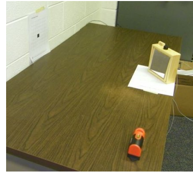
The tip-tilt mirror assembly and laser.

Our tip-tilt module uses a toy Labryinth game. Labyrinth is a common toy where the goal is to tip and tilt the board by using two knobs to guide a marble through a maze without the marble falling into a hole. We took the Labryinth game and glued a mirror over the playing surface to create a model of a tip-tilt adaptive optics module.